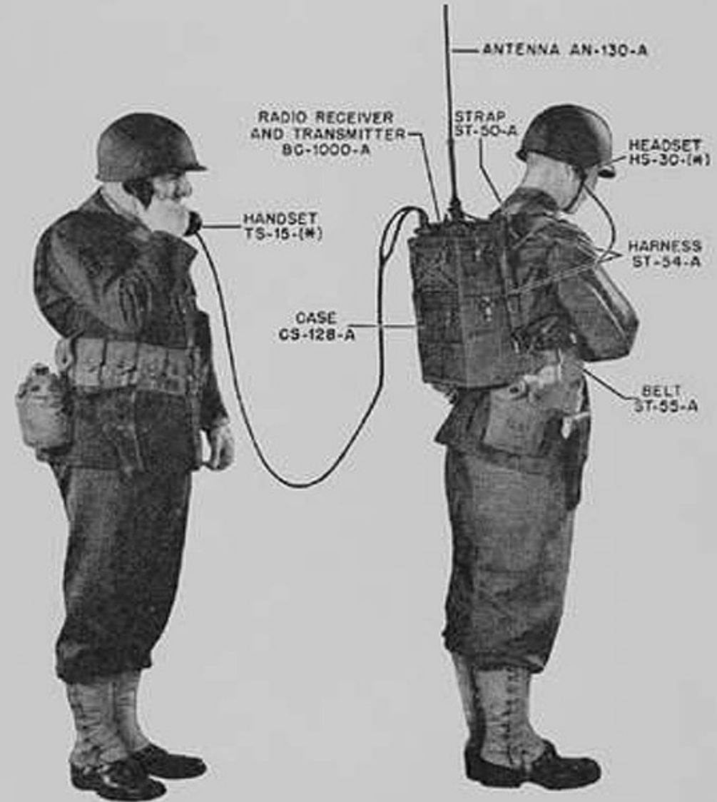
Figure 1. Radio Set SCR-300-A. In Use, Viewed From Right Side.